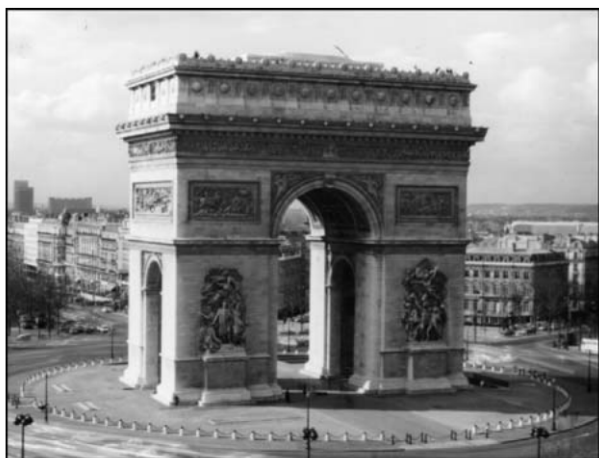
Erich Lessing/Art Resource, NY